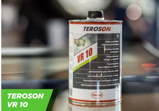
TEROSON VR 10