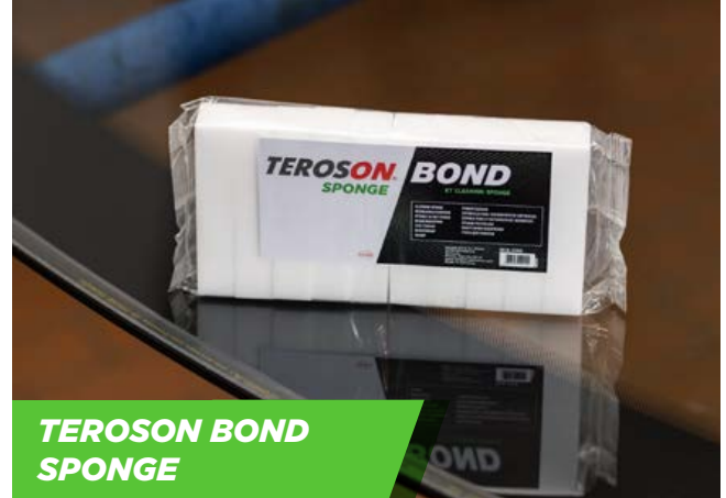
TEROSON BOND SPONGE